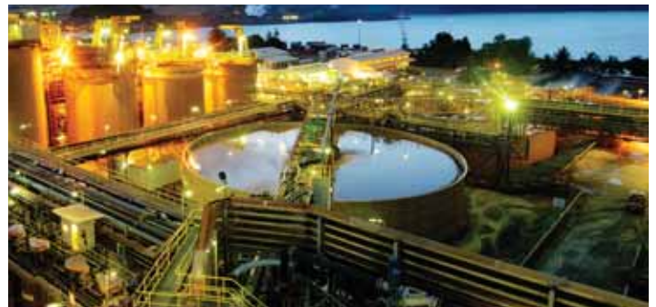
Lihir Gold Mine, Papua New Guinea, 2007: Versatility made Interzone® 954 one of the key products chosen for this major project.